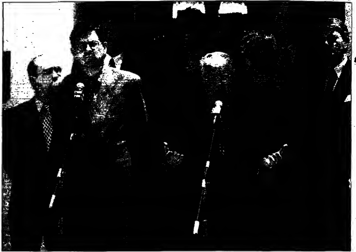
Norway's Foreign Minister Bjorn Godal (left) and Foreign Minister David Levy hold a press conference outside the Foreign Ministry yesterday.

Arafat said there is 62% unemployment in Gaza and 48% unemployment in the West Bank, that closures are costing the PA $7 million a day, produce is being held up at checkpoints, and quarries have been closed between